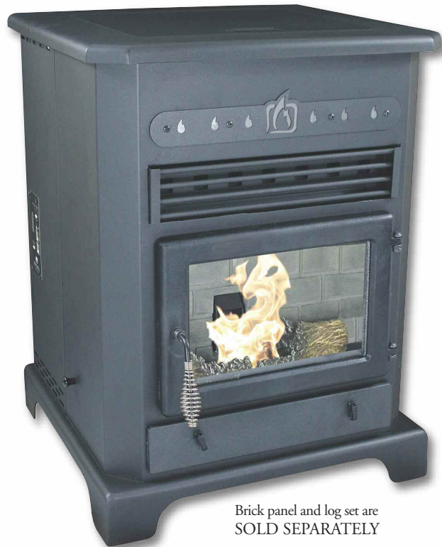
Brick panel and log set are SOLD SEPARATELY