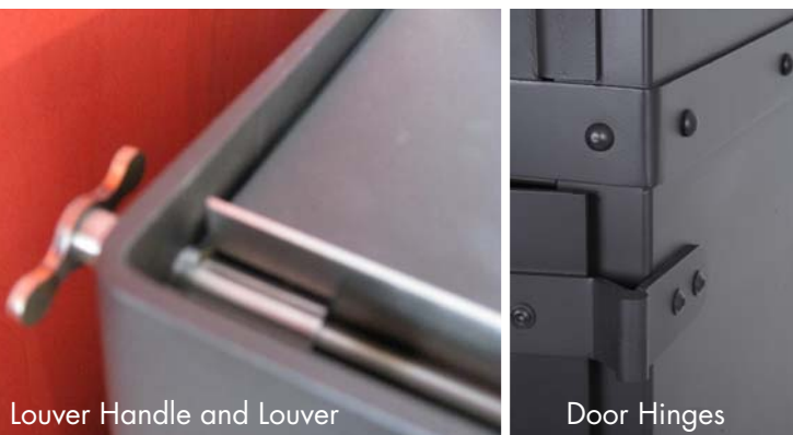
Louver Handle and Louver