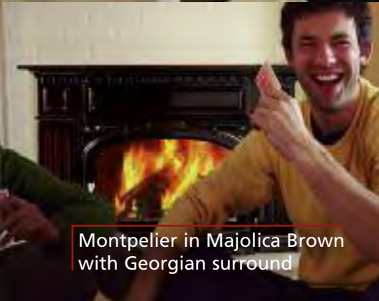
Montpelier in Majolica Brown with Georgian surround