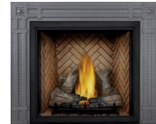
Rectangular Decorative Surround Wrought Iron Finish *shown with basic front