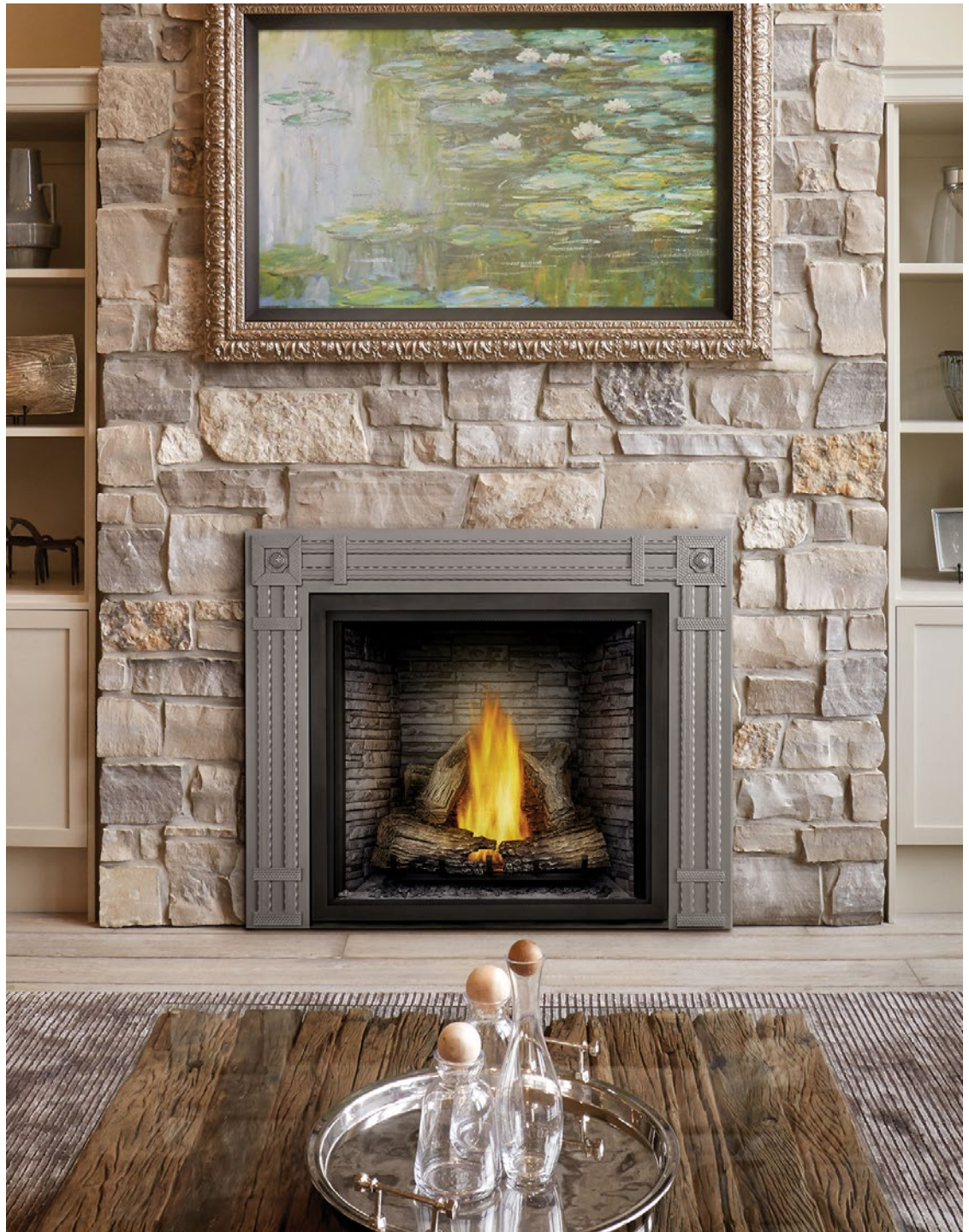
STARfire™ 35 shown with Wrought Iron Rectangular Surround and Classic Front