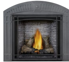
Arched Decorative Surround Wrought Iron Finish *shown with decorative front