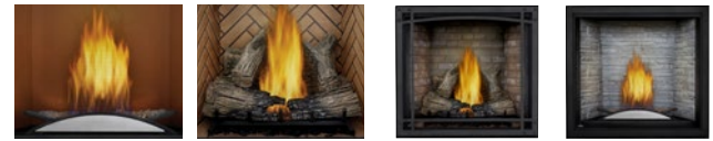
Fire Cradle with CRYSTALINE™ Glass PHAZER™ Log Set Decorative Front Classic Front