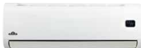
NLIS - 16 SEER Heat Pump