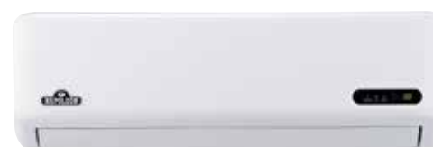
NC15 - 15 SEER Air Conditioner