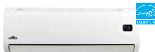
NH19 - 19 SEER Heat Pump