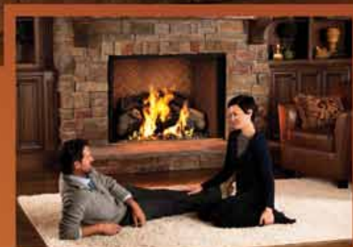
Estate 50 with Herringbone refractory brick panel in the Rust color option