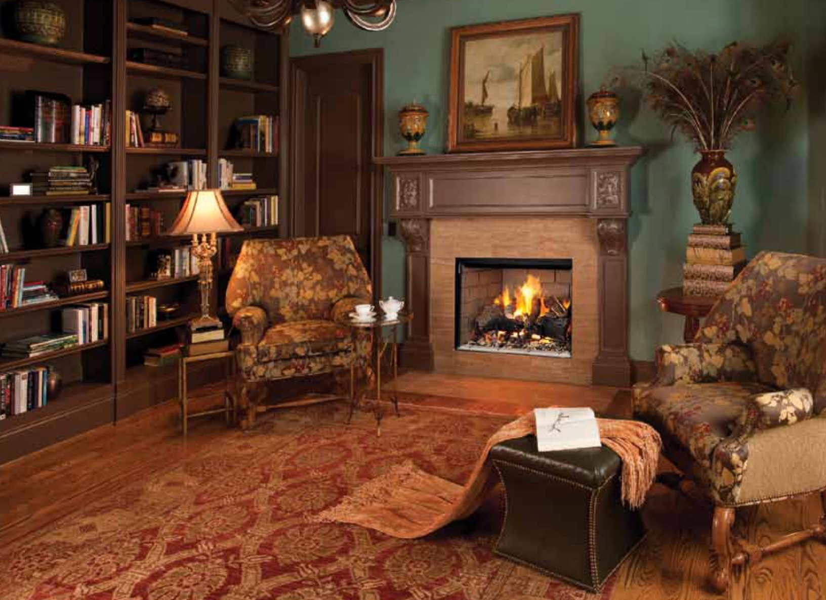
Estate 36 shown with Traditional refractory brick panels in Standard Grey color

■ Nothing commands attention in a room and elicits a feeling of comfort more than a roaring, crackling wood fire. The Dave Lennox Signature ™ Collection Estate™ Series family of wood-burning fireplaces is available in 36"-, 42"-, and 50"-wide openings—with exquisite details and a clean, classic masonry look. But regardless of what size you choose, the views are nothing less than stunning. In addition, the Estate Series offers several standard and optional design choices to help you create the fireplace that harmonizes with your home and aesthetic vision. ■