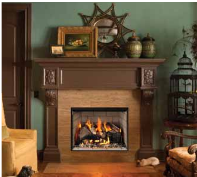
EST-36 shown with Traditional refractory in Standard Grey