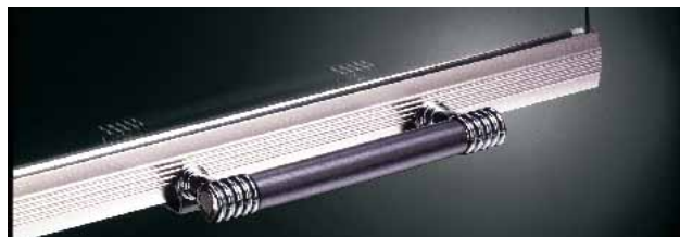
Estate 42 shown with brushed stainless doors