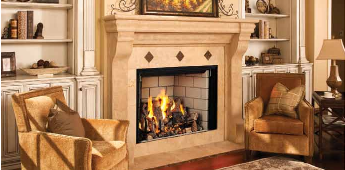
Estate 42 shown with Traditional refractory brick panels in the Creamer color option