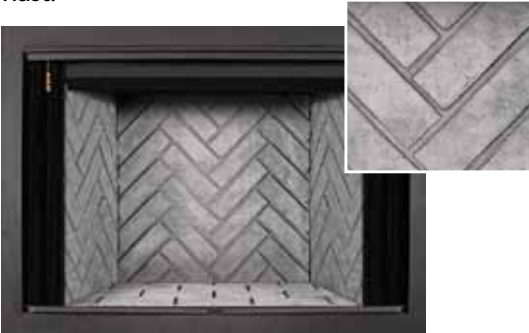
Standard Grey Herringbone

Choose from Herringbone or Traditional patterns in Standard Grey, Creamer, Cappuccino and Rust.