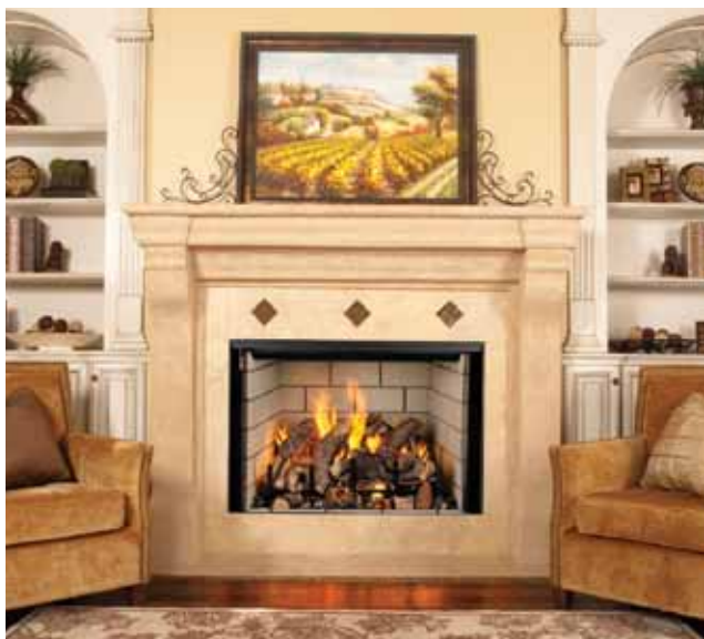
EST-42 shown with Traditional refractory in Creamer