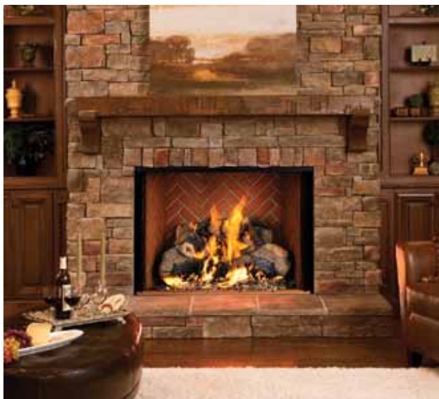
EST-50 shown with Herringbone refractory in Rust