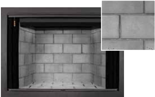
Standard Grey Traditional