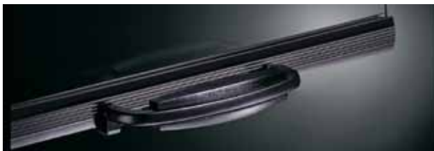
Estate 42 shown with black doors