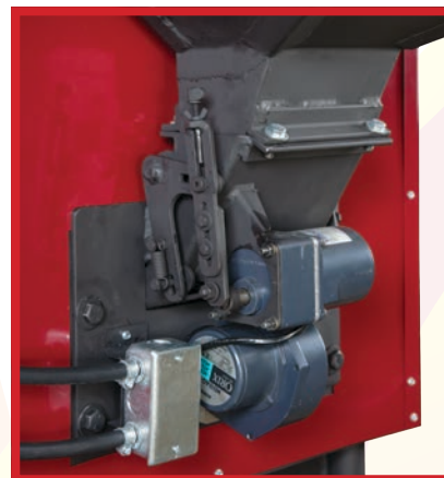
Detail of stoker mechanism