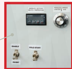
Detail of Burntrol Modulating Controller