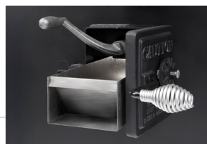
Removable Ash Pan