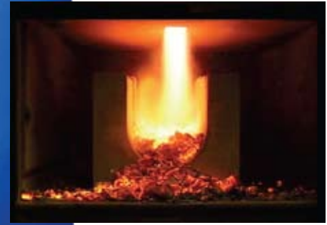
Actual Econoburn™ Combustion Chamber