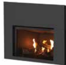
LARGE 32" H X 43-1/4" W (32" Model) 30" H X 41" W (27" Model)