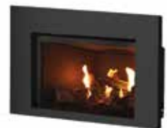
MEDIUM 25" H X 41" W (32" Model) 26" H X 37" W (27" Model)