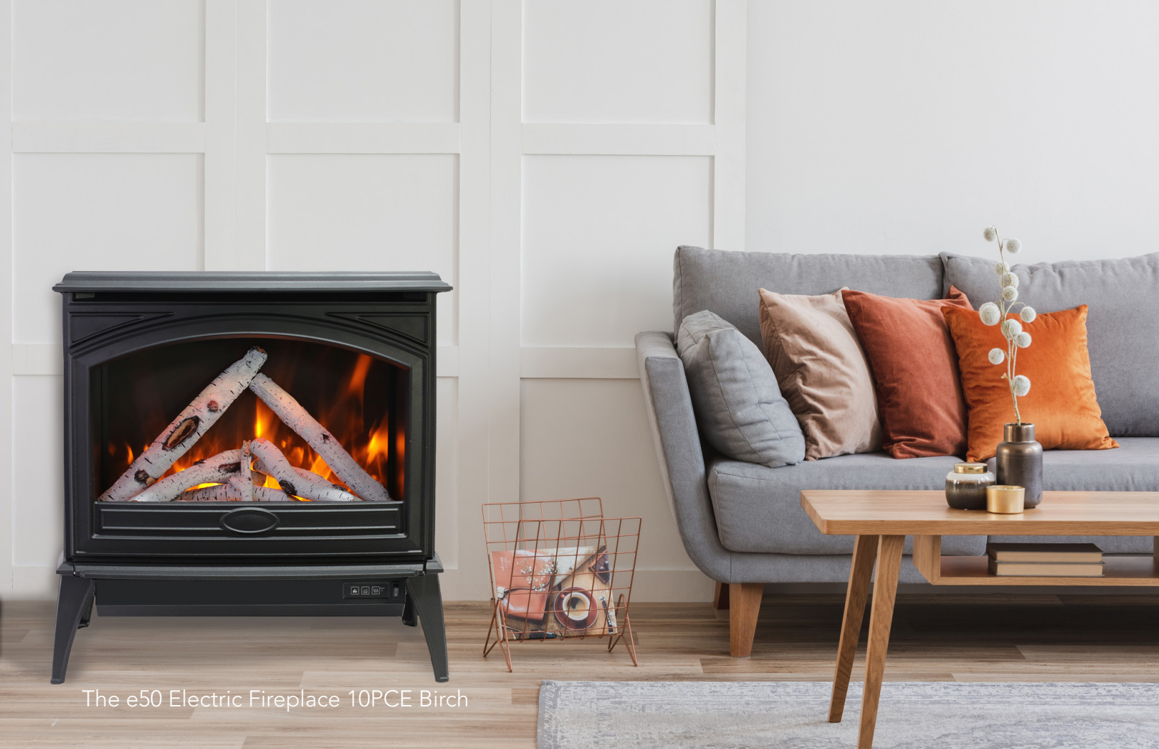
The e50 Electric Fireplace 10PCE Birch