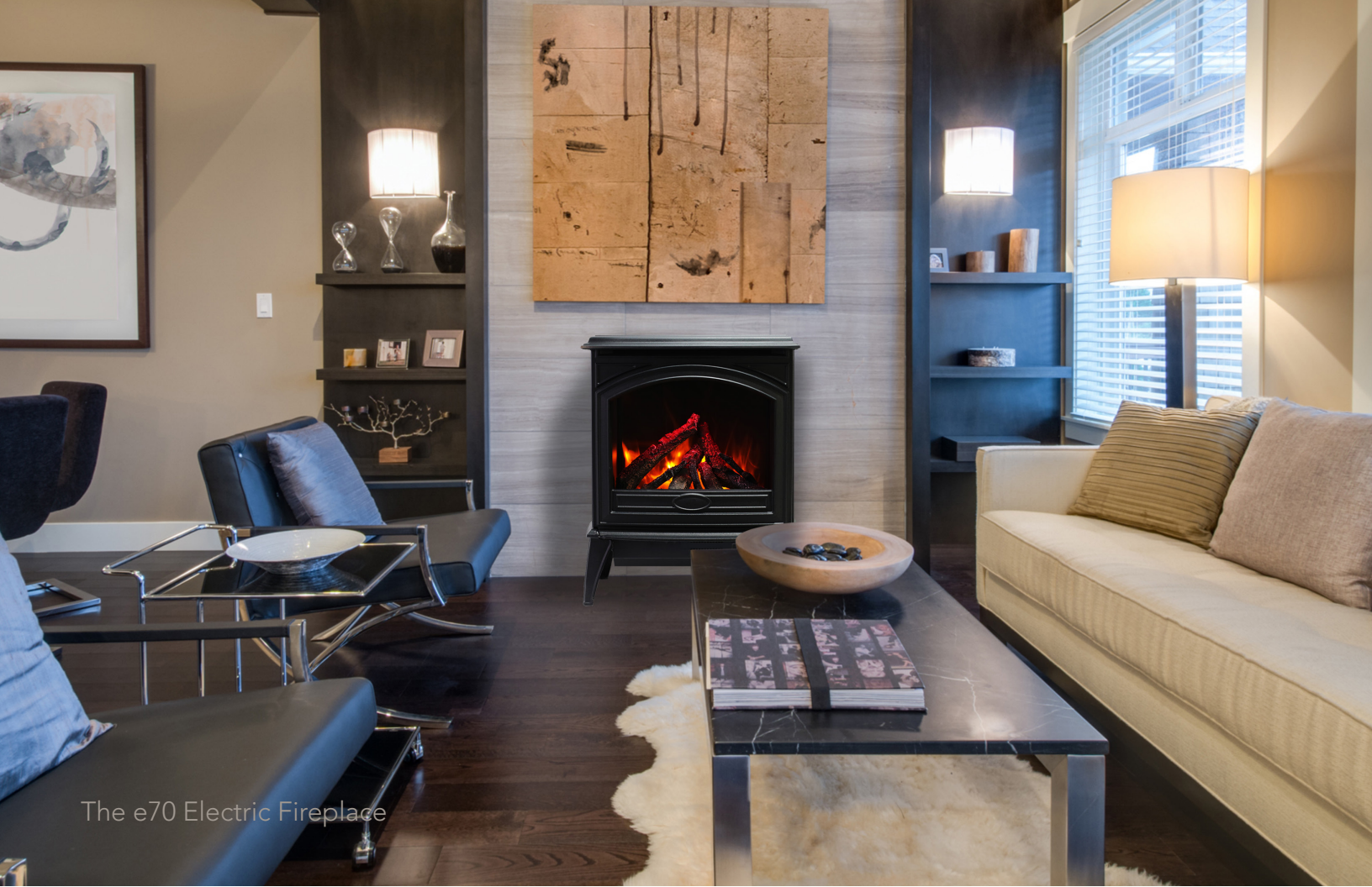
The e70 Electric Fireplace