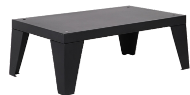
Leg Base Dimensions *Height, Width, Depth: 7x 20 1/2 x 12 5/8