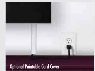
Optional Paintable Cord Cover