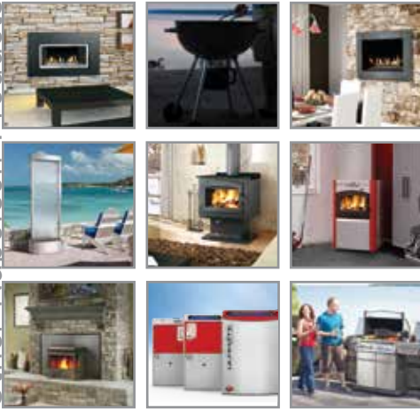
Fireplace Inserts • Charcoal Grills • Gas Fireplaces • Waterfalls • Wood Stoves Hybrid Furnaces • Pellet Inserts • Heating & Cooling • Gourmet Gas Grills