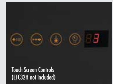
Touch Screen Controls (EFC32H not included)