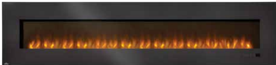
EFL100 | Electric Fireplace