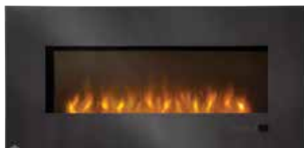
EFL48H | Electric Fireplace