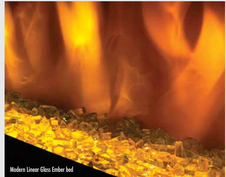
Modern Linear Glass Ember bed

Slimmest Electric Fireplace in the industry! Napoleon's new Electric Slimline Series offer a clean, crisp contemporary design and the conveniences of simply hanging, plugging in and enjoying. Napoleon's Electric Slimline Series features an unmatched flame technology and realistic flame pattern, a generous glass front with wide black glass framing, a contemporary glass ember bed that complements the minimalist design and an LED light strip. All units can be recessed into a 2" x 4" wall for reduced protrusion into the room or surface mounted on the wall. A beautiful way to add ambiance and comfort to any room in the home.