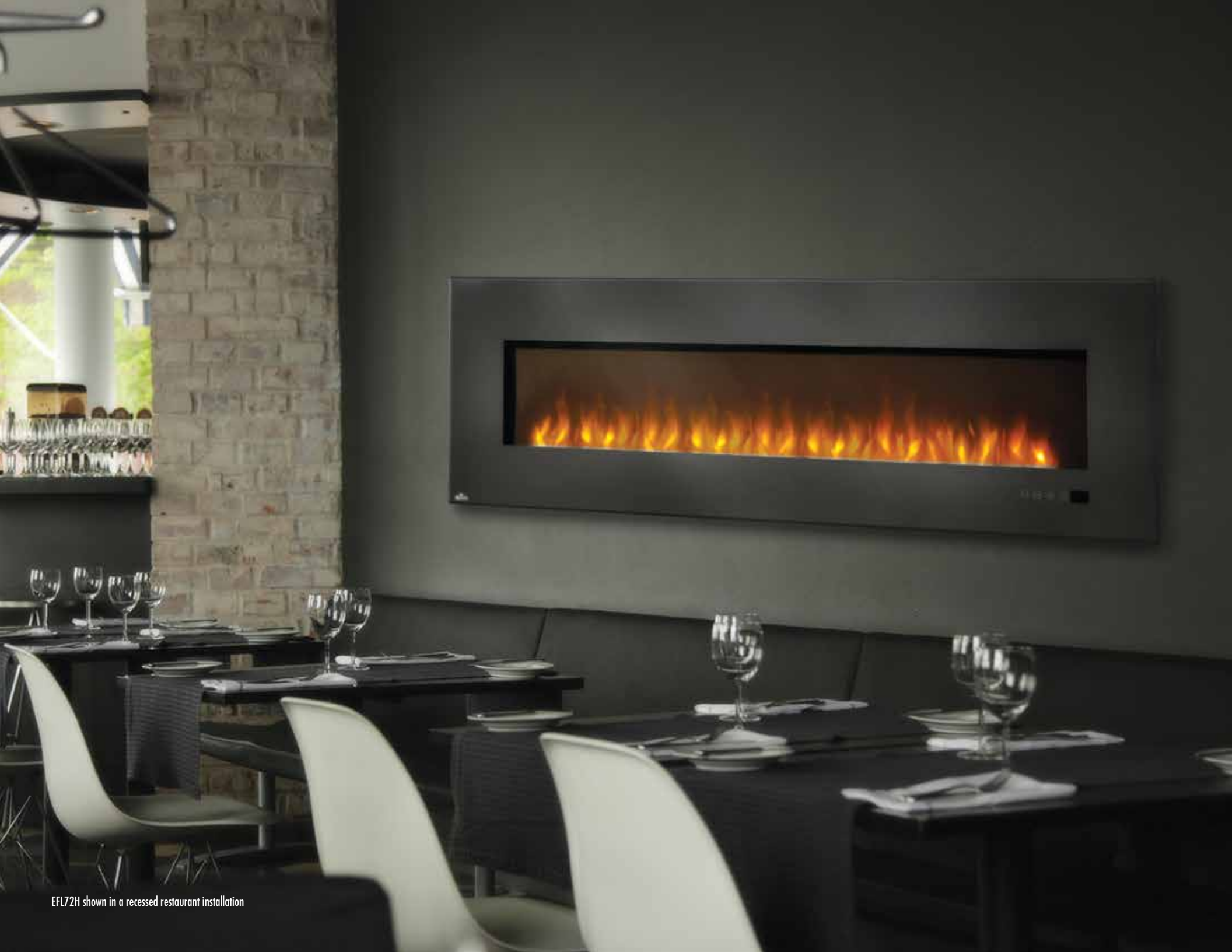
EFL72H shown in a recessed restaurant installation