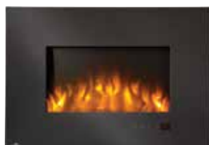
EFL32H | Electric Fireplace