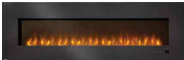
EFL72H | Electric Fireplace