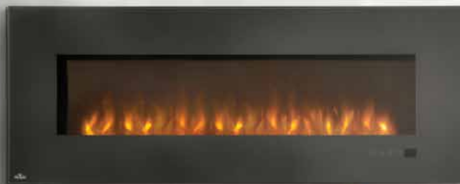
EFL60H shown in a recessed boardroom installation