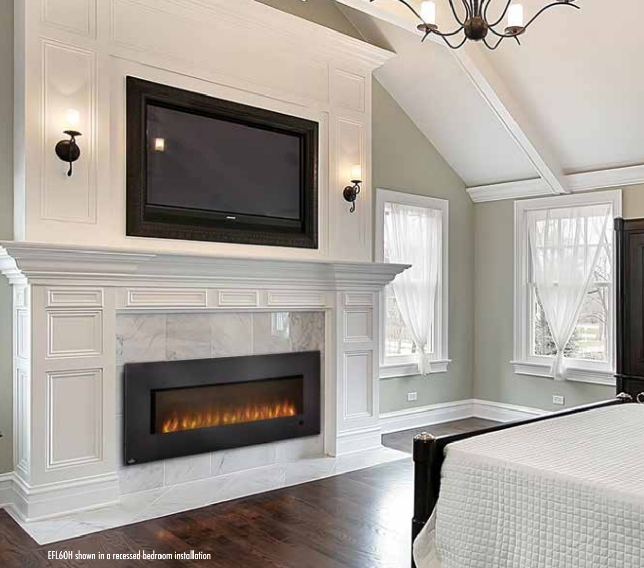
EFL60H shown in a recessed bedroom installation