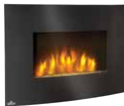
EFC32H | Convex Front Electric Fireplace