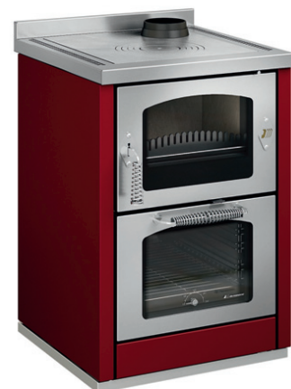
Domino 6 Maxi