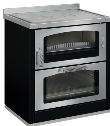
Domino 8 Maxi