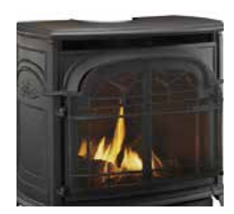
Durable cast iron firebox