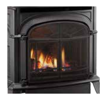
Durable cast iron firebox