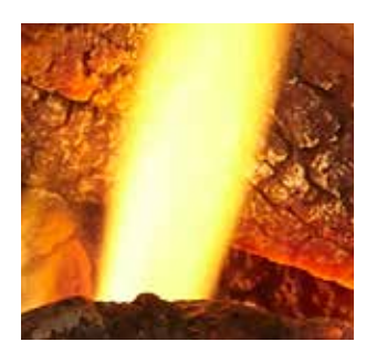
No power, no problem; standing pilot models available