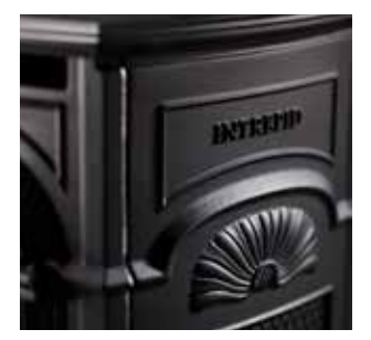
Timeless cast iron styling with a furniture-quality finish