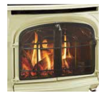
Durable cast iron firebox