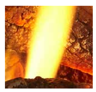
No power, no problem; standing pilot models available