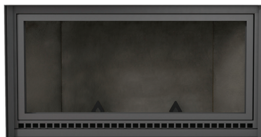
Smooth Decorative Brick Panels