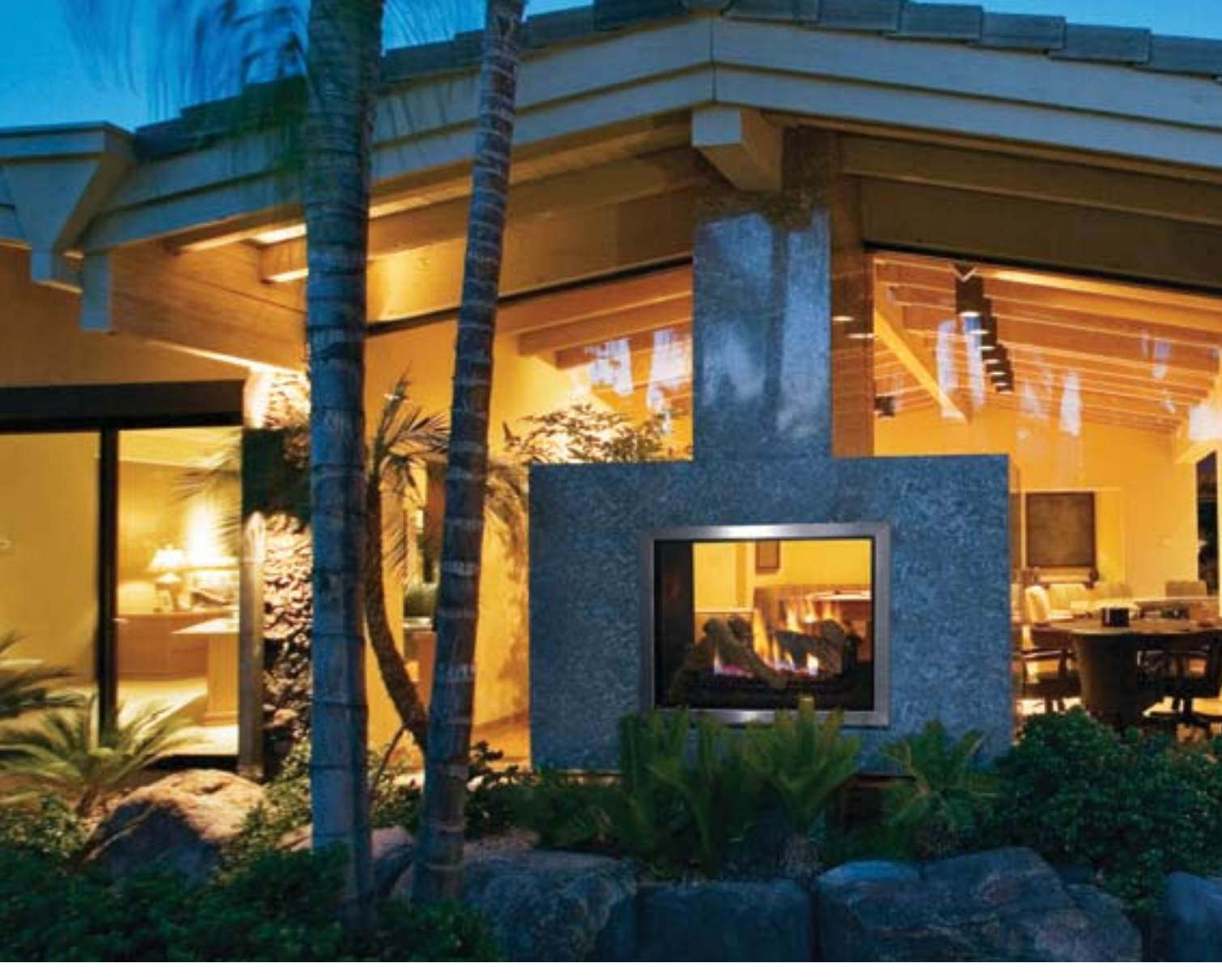
Montebello® See-Through shown with Black Porcelain liner and outdoor window kit.

With its substantial opening and stunningly realistic fire presentation, the Montebello<sup>®</sup> gas fireplace has been one of Lennox' most popular models. Today, we are proud to offer this classic fireplace in a see-through configuration, offering the flexibility to enjoy a cozy fire in multiple rooms or from an outside gathering place. The Montebello See-Through can be installed between two interior walls or, with the addition of the outdoor kit, between an indoor wall and an outdoor wall. When it's not burning, the fireplace makes an attractive statement with a large "true-to-life" split-oak log set and fiber ember top. With the click of a remote or flip of a switch, a vibrant fire fills the firebox while the embers and logs show off a warm comforting glow. Plus, the Montebello See-Through is available with premium accessories to give you the freedom to customize