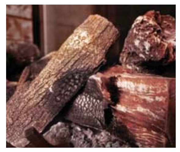
High-definition charred split-oak log set