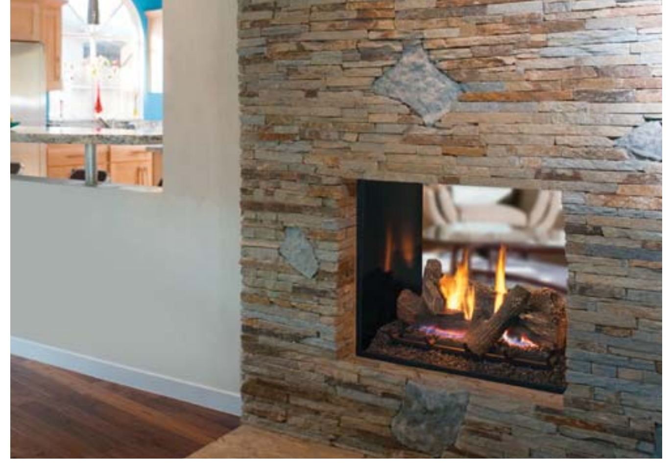
Montebello® See-Through shown with Black Porcelain liner used indoors between rooms.