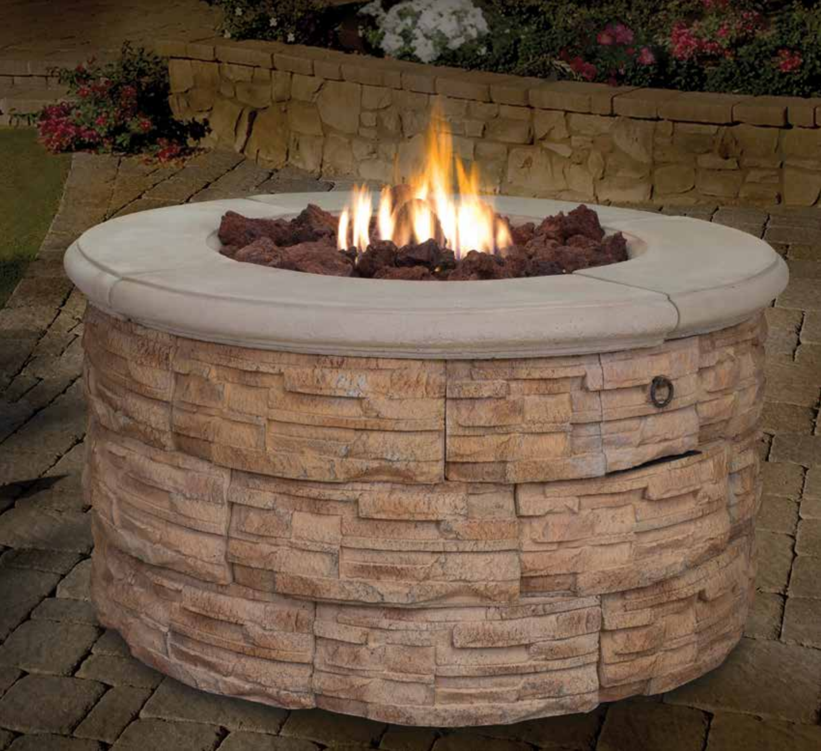
FEATURED Firestar Fire Pit with LedgeStone blocks