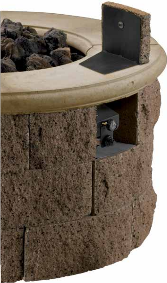
Concealed Fire Pit controls