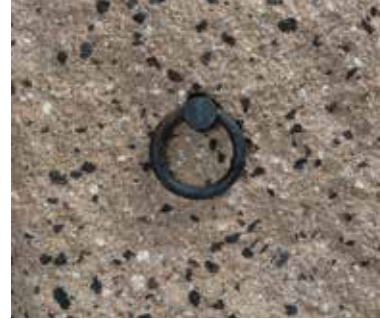
Chiseled Face Stone