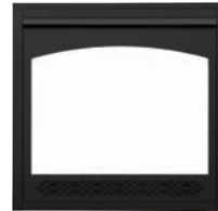
Heritage Decorative Front