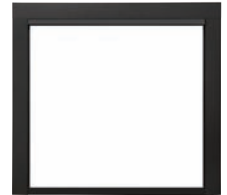
2" Trim Kit