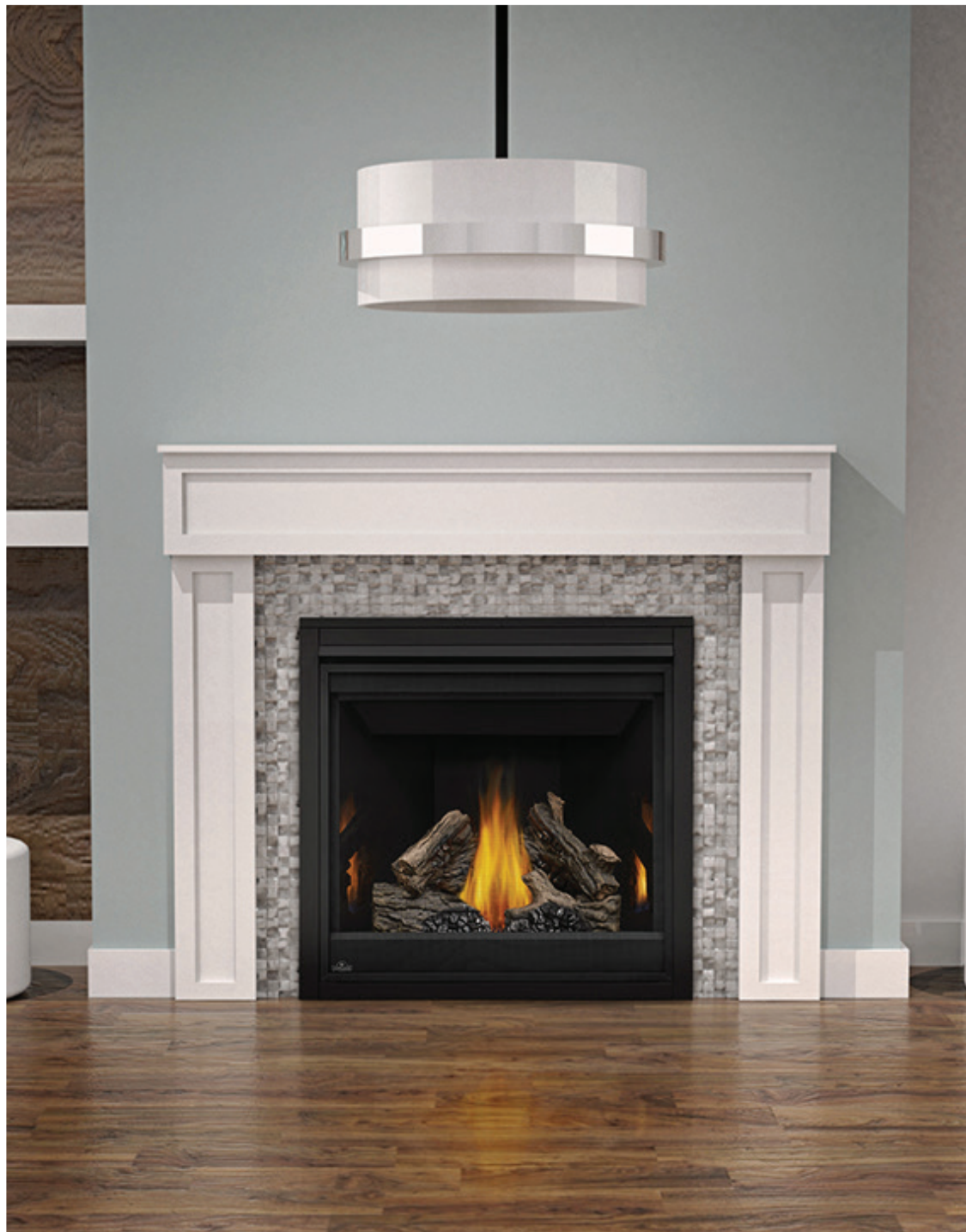
Ascent™ 36 shown with MIRRO-FLAME™ porcelain reflective radiant panels