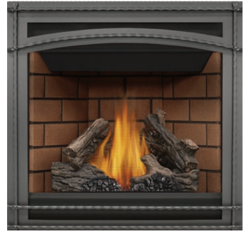
Wrought Iron Front X36WI