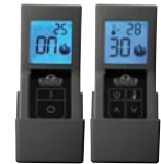
Convenient Remote Control