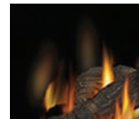
MIRRO-FLAME™ Porcelain Reflective Radiant Panels