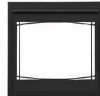
Zen Decorative Front