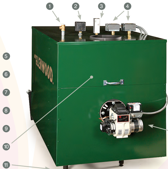
The Glenwood (back view)