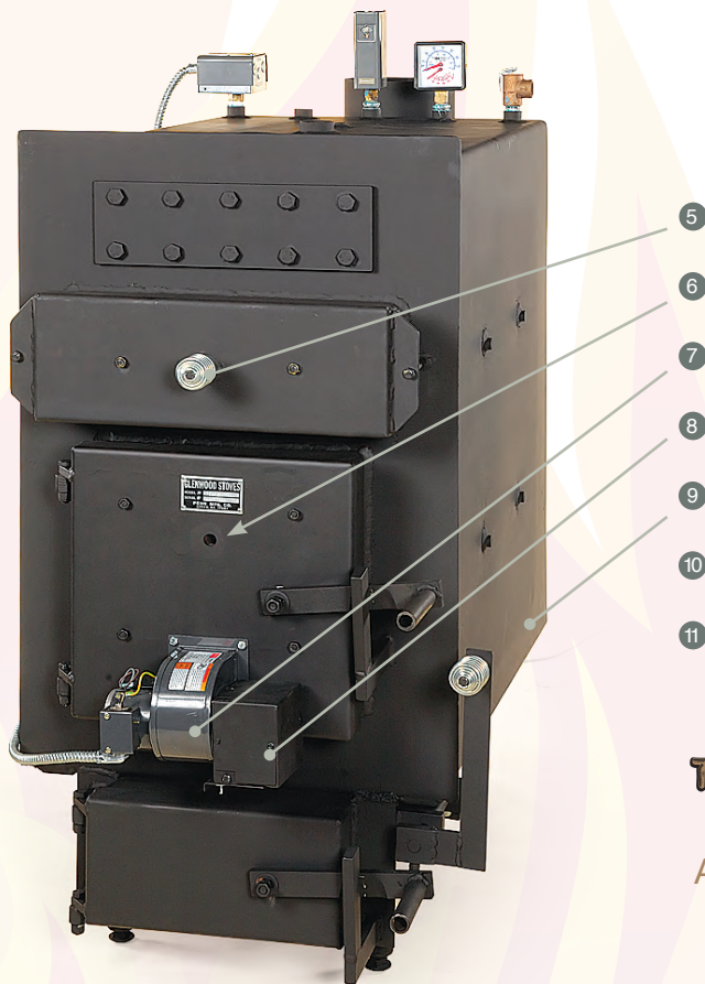
The Glenwood (without insulation panels)